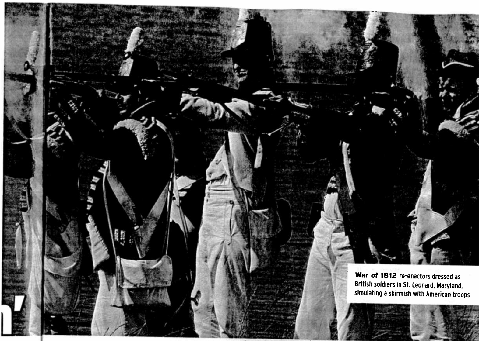
War of 1812 re-enactors dressed as British soldiers in St. Leonard, Maryland, simulating a skirmish with American troops